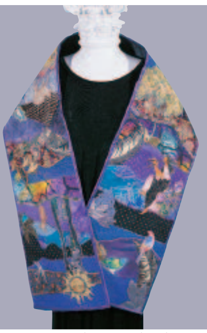
Many Blessings Shawl

The act of ritual ceremony helps us to make the cycles of life more meaningful. It is also an important way to participate in a myth, creating a union of the physical with that of the spiritual. The ceremony renews our inner spirit whose source is the sacred. It bonds order and chaos by connecting such diverse patterns and materials that bridge space and time. Seemingly opposing concepts like Goddess and woman are brought into balance in keeping with the alchemical first principle: as above, so below . When we put on clothing we are imitating our spirit which cloaks itself in different bodies at different times. It is a ritual that can remind us we come into the world naked and wear clothes until we are ready to be naked again.